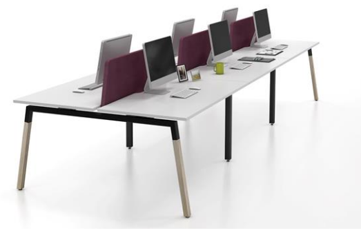
OXO Screen - Full fabric wrapped screen with tapered design and rounded top corners

320/480mm High 1050/1200/1500/1800/2100mm Wide