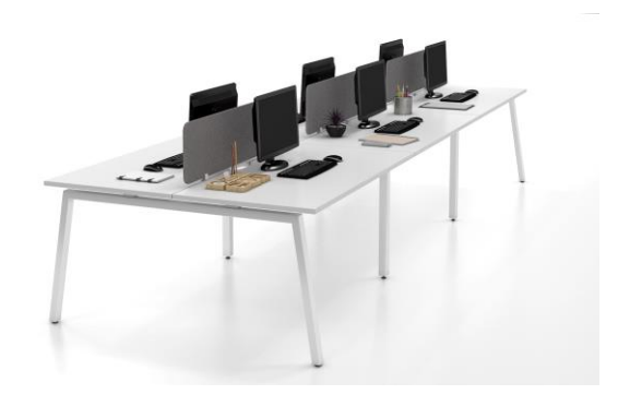
Track Screen - Perspex or Echopanel screen mounted on central track system

320/480mm High 750/1200/1500/1800/2100mm Wide