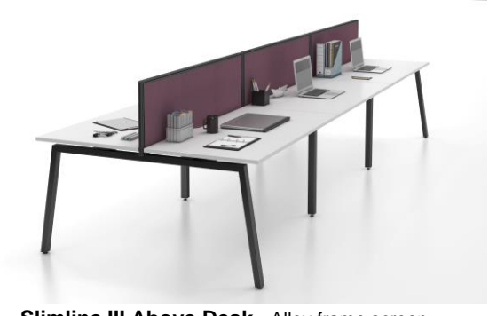
Slimline III Above Desk - Alloy frame screen 30mm thick upholstered in fabric with function rail

320/480mm High 750/1200/1500/1800/2100mm Wide