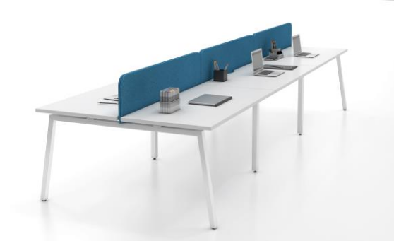
GEN-A Screen - 2off 9mm full fabric wrapped screen joined into one with 80mm rounded top corners

320/480mm High 1050/1200/1500/1800/2100mm Wide