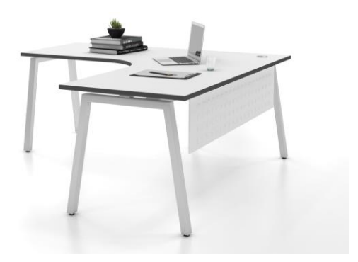
L-Shape (Modesty panel optional)